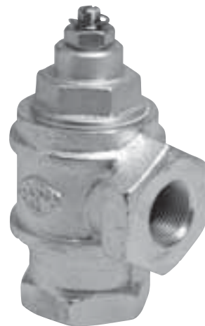
616 OR 636 ANTI SYPHON VALVE WITH BACK PRESSURE RELIEF

The anti syphon valves shut off product flow when lines are broken, preventing fuel spillage and fire hazards. Each valve has an adjusting mechanism allowing for various liquid head pressure settings within the valve range. The adjusting mechanism is lockable after the preferred setting is made. EBW anti syphon valves are set to maximum head pressure when shipped from the factory. The anti syphon valve also includes a pressure relief valve, eliminating thermal expansion of fluid in the lines.