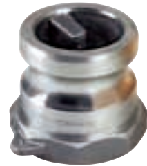
633AST Spout Adaptor