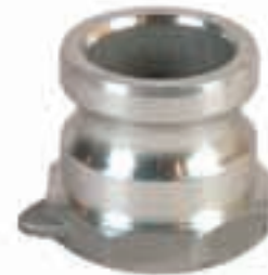
633AST Spout Adaptor

366FAST-XXXX, Male Thread Equivalent of Adaptors above